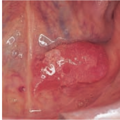
Red patch on ventral surface of tongue and floor of mouth Refer to Dentist or Doctor