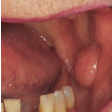
Fibroepithelial polyp of the buccal mucosa Refer to Dentist or Doctor

Mouth cancer is usually preceded by visible changes in the mouth that can be detected by a quick, visual inspection. Over the page, there is a list of potential signs and symptoms of mouth cancer. But other conditions may present with similar symptoms. Below are examples of some malignant and potentially malignant lesions that you may encounter: