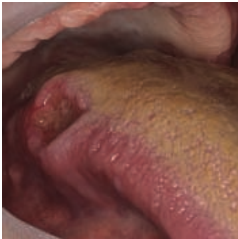
Solitary ulcer with rolled borders on the lateral border of the tongue Refer to Dentist or Doctor