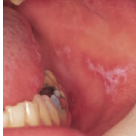
Lichen planus of the buccal mucosa Refer to Dentist or Doctor