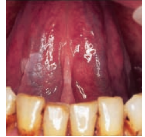
White patch on ventral surface of the tongue Refer to Dentist or Doctor