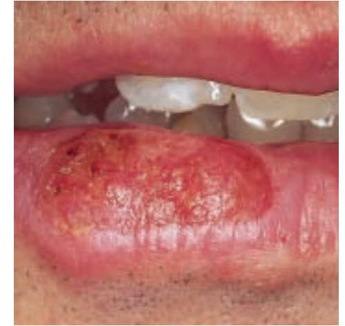
Shallow ulcer on lower lip Refer to Dentist or Doctor