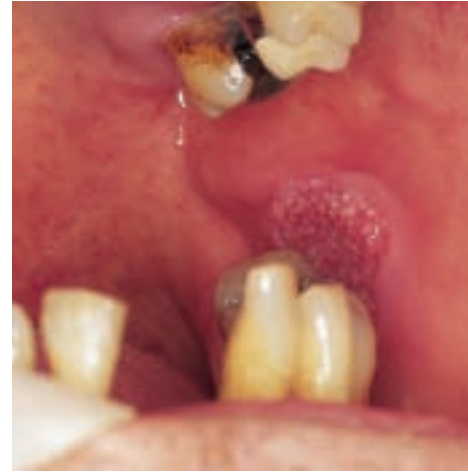
Speckled lesion on left buccal mucosa Refer to Dentist or Doctor